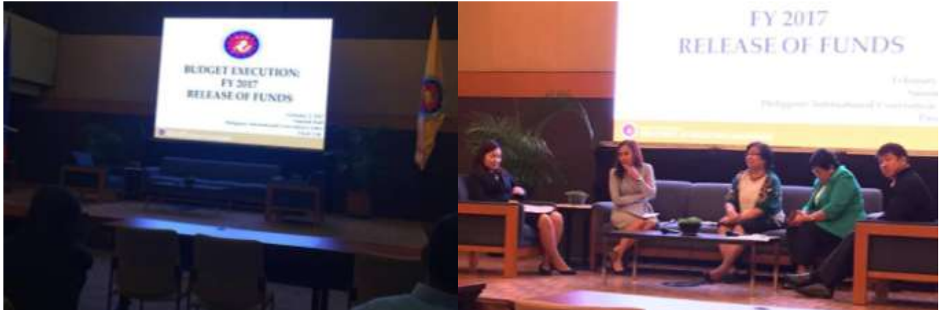
Officials from the DBM, DOF and Bureau of Treasury during the open forum.