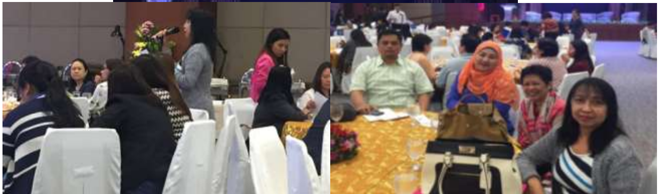
SPDA Officials headed by the Finance Manager during the forum.