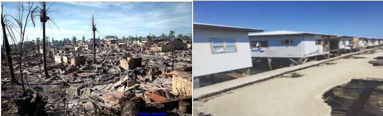
Before and after pictures of the SPDA Rio Hondo Property, Zamboanga

For period under review, the Authority still continues coordination with National Housing Authority (NHA) Central Office in coordination with their Region IX office. As per information from NHA, the P 20 million budget for the property was downloaded to NHA and is available subject to some documentary requirement.