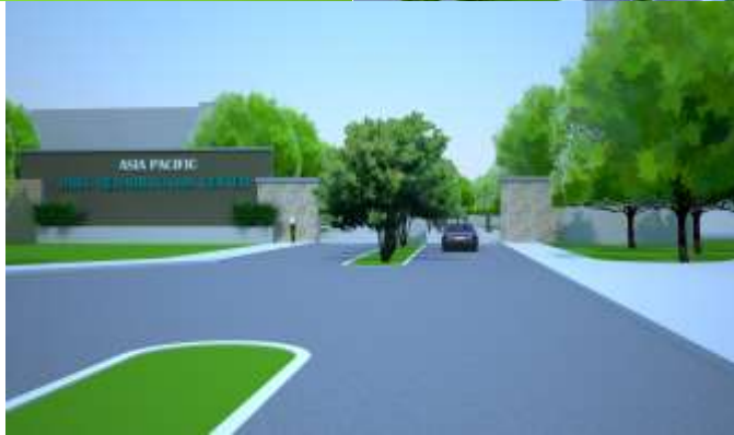
Site Development Plan of Pequeño Property into a