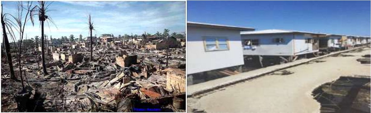
Before and after pictures of the SPDA Rio Hondo Property, Zamboanga

Other properties subject of socialized housing per Executive Order No. 98 and earlier Slum Improvement & Resettlement mandates and programs of the NHA on socialized housing like the Community Mortgage Program and the Community Land Acquisition and Support Program which are a subjects of negotiation with the informal settlers in the area are the SPDA Valencia City, Don Carlos and Maramag Properties in Bukidnon; SPDA Sasa, Davao City Property occupied by the Sasa Urban Housing Association (SUHA) and the SPDA Malagamot, Davao City property.