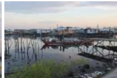
SPDA Officials accompanied by the NHA Region IX Officials during the on-site and ocular inspection of the SPDA Rio Hondo Property in Zamboanga City.