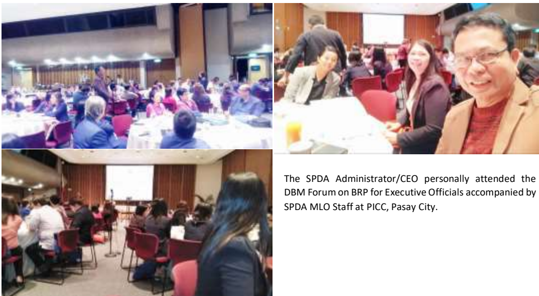
The SPDA Administrator/CEO personally attended the DBM Forum on BRP for Executive Officials accompanied by SPDA MLO Staff at PICC, Pasay City.