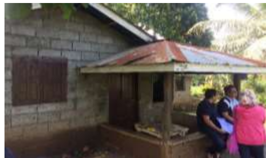
Ocular inspection of the SPDA Property in Maramag, Bukidnon last October 2, 2019.