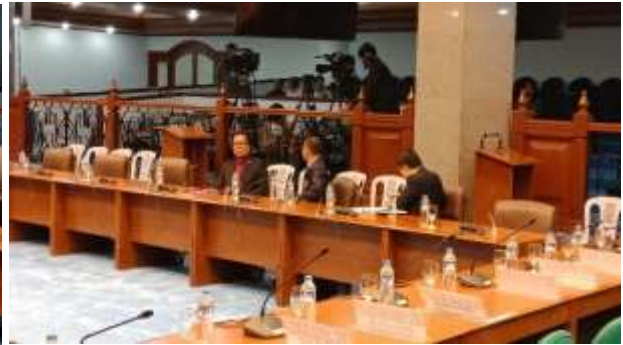
Senate Committee on Finance presided by Senator Panfilo Lacson during the SPDA Budget Presentation FY-2019 held at the Senate of the Philippines attended by SPDA Officials led by the SPDA Administrator Abdulghani "Gerry" A. Salapuddin.