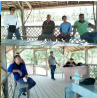
Meeting with the caretakers of the SPDA Vitali Property and on-site ocular inspection in the area during the 3-day travel of the SPDA Administrator/CEO.