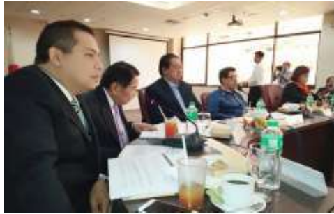
Members of the House of Representatives during the joint hearing deliberation of the Bangsamoro Basic Law at Congress,