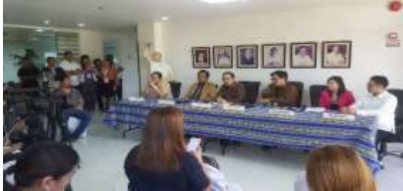
Press Conference during the break of the MinDa Board Meeting held at the lobby of the MinDa Office, Davao City.