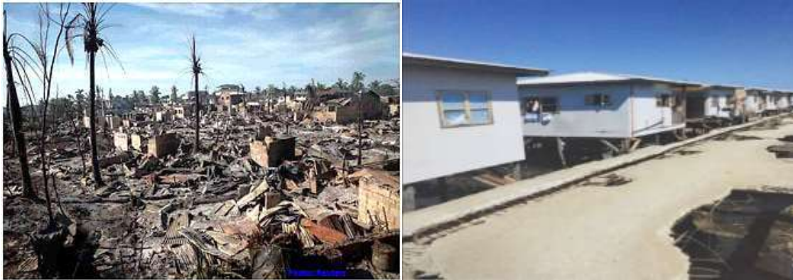
Before and after pictures of the SPDA Rio Hondo Property, Zamboanga

For the period under review, the Authority continued coordination with National Housing Authority (NHA) Central Office through their Region IX Office for the compensation of the subject property. As per information from NHA, the P 20 million budget for the property was downloaded to NHA and is available subject to some documentary requirement.