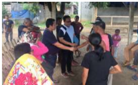
SPDA Administrator/CEO met with the residents of the SPDA Property in Don Carlos, Bukidnon during the ocular inspection of the property last October 2, 2019.