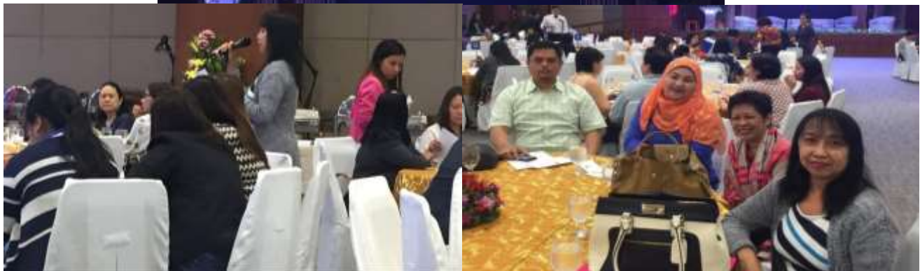
SPDA Officials headed by the Finance Manager during the forum.