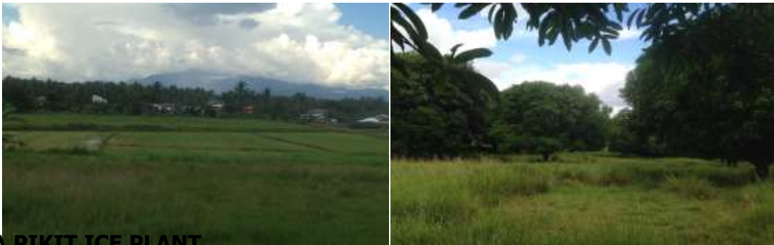
SPDA PIKIT ICE PLANT

For the preliminary first semester of 2017, continuous maintenance of the mango and rice production and project facilities is still being undertaken by project personnel. The Authority still continues to scout for prospective land developer under a Joint Venture Undertaking for the redirection of the property usage into a Housing Project. Although interests from private entities for development of the property have been received, the Authority cannot proceed to formalize possible arrangements/partnership yet until the status of SPDA is resolved.