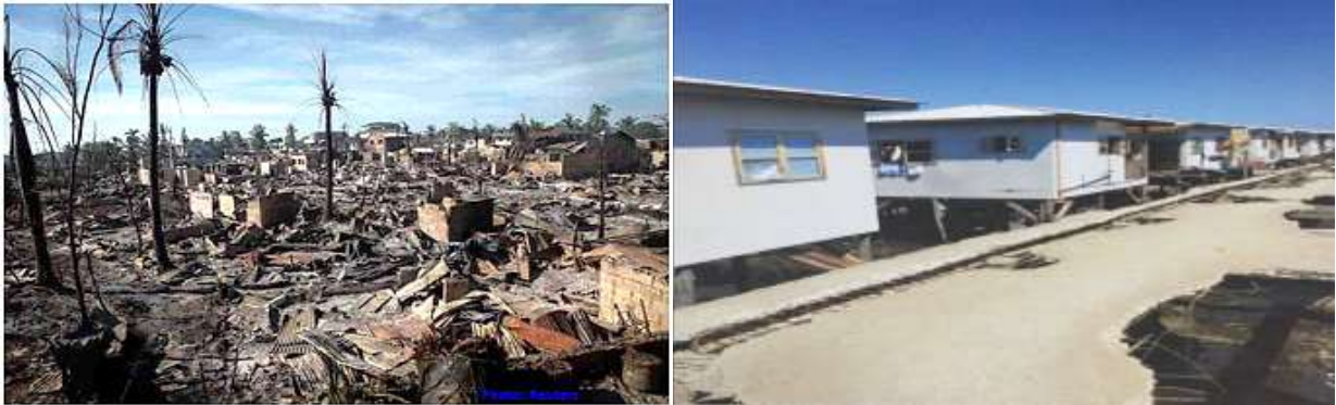
Before and after pictures of the SPDA Rio Hondo Property, Zamboanga

For period under review, the Authority still continues coordination with National Housing Authority (NHA) Central Office in coordination with their Region IX office. As per information from NHA, the P 20 million budget for the property was downloaded to NHA and is available subject to some documentary requirement.