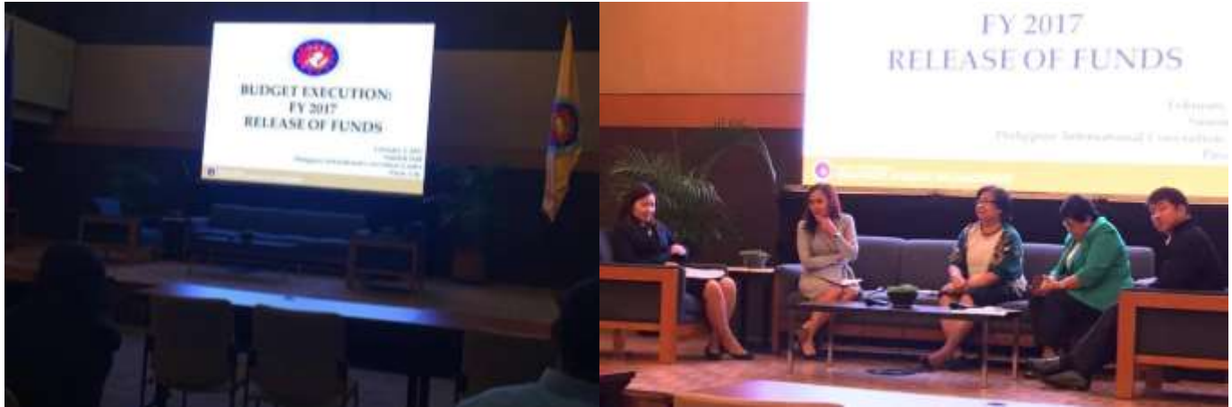
Officials from the DBM, DOF and Bureau of Treasury during the open forum.